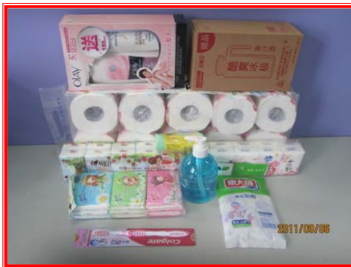
Prizes the Champion won in this year's game, the most expensive one were “robbed” by girls in the photo on the right