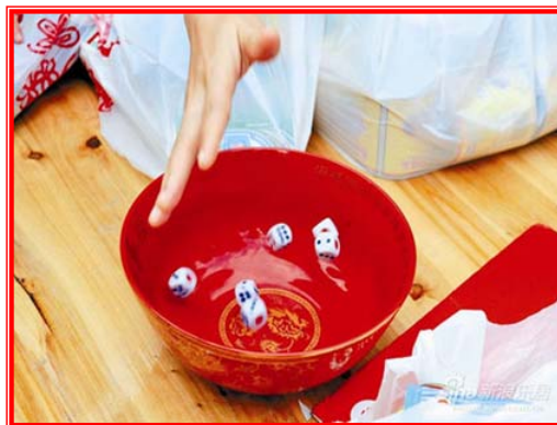
Tools for bobing

Required are a big bowl, six dices, and prizes for the players (there will be introduction about how many prizes should be prepared in the part of regulations)