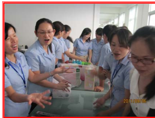
Happy time when we playing Bobing